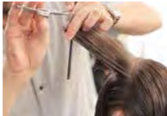
8. Continue with pivoting sections and work consistently until the ear level.