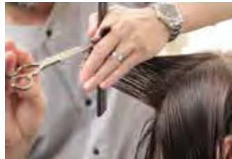
7A. Comb and elevate the hair 90° to the occipital bone, remove the corner of weight squarely to the head shape using point cutting.