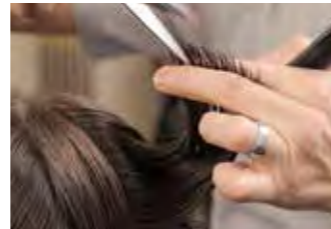
9A. Note the hand and body position and repeat the same technique on the opposite side of the head.