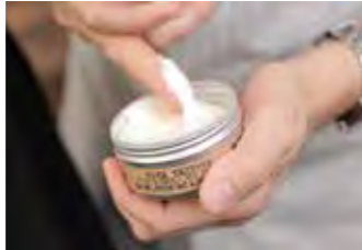
2A. Apply Pure Texture Molding Paste as a cutting agent.