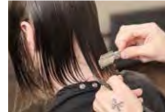
4A. Utilizing the razor reshape the baseline horizontally at a low elevation from the back to the sides.