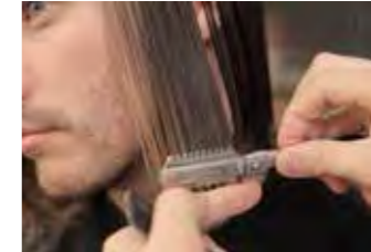
5. In front of the ear continue rounding up the cut to complete the perimeter.