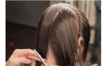
6. While keeping the radial division in place take a center vertical section from the crown to the nape.