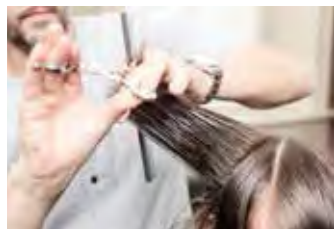
11A. On the larger opposite side -to keep the balance- raise the elevation slightly higher and work squarely to the round of the head.