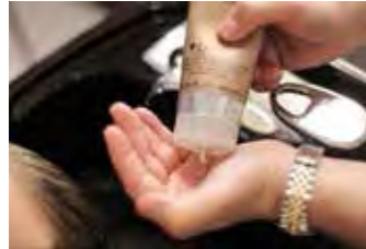
1. Prepare the hair using Wise Up Shampoo from Bed Head for Men.