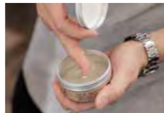
13A. Before the styling apply Slick Trick Pomade to the hair. Blow-dry the hair off the face with the hands and a small paddle brush.