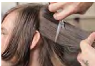
12. To remove additional weight use controlled slicing from the mid lengths towards the ends.