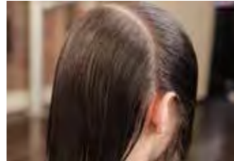
3. Take a radial part from ear to ear across the crown.